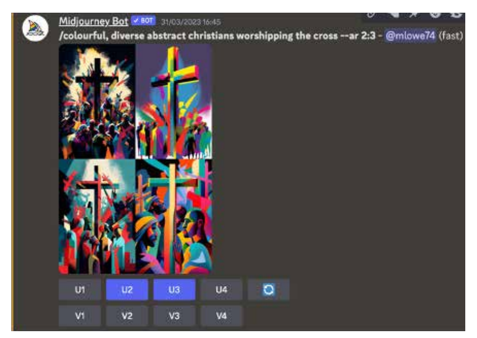
Having a private chat on Discord with the Midjourney Bot

It is a type of artificial intelligence system capable of generating images in response to prompts made by humans.